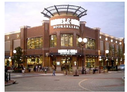
Crocker Park; Westlake, OH

Dull as the suburbs but lacking in the vivid underlying pathology of suburbia, New Urbanism has become the acceptable face of sprawl.