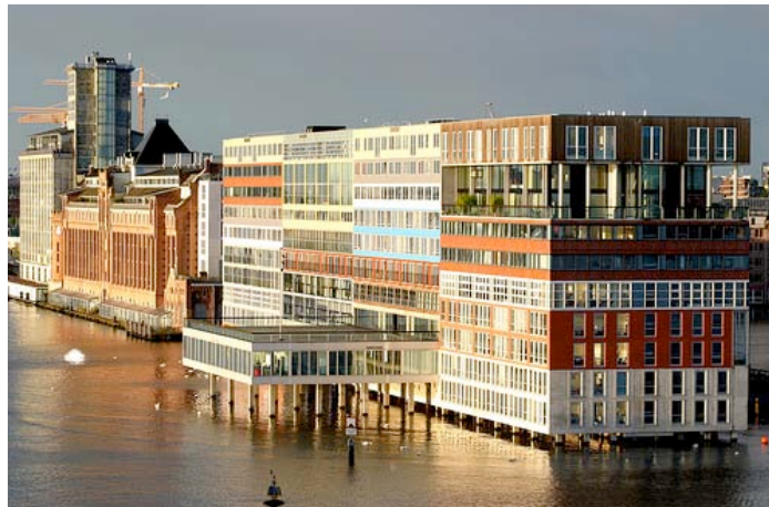
Mirador, Spain by MVRDV; Silodam by MVRDV

The Swedish government has begun a competition for a design to replace a 1930 Stockholm bridge with a system of locks, roadways and shops. In Madrid, the government is planning to bury a four-mile section of highway to cover it with parks and new housing. And the French have just completed a nine-month study of the future of urban Paris as the first phase to create a more sustainable and socially integrated "post-Kyoto city," with an expanded Metro system and new parks. The proposals